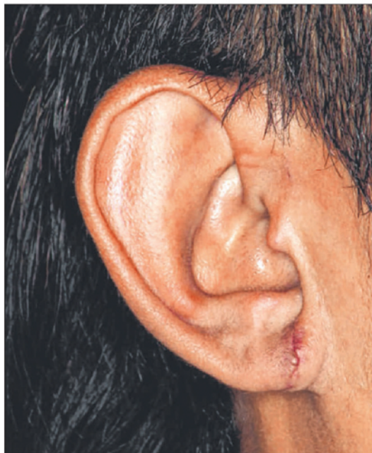
Reconstruction of a gauged ear lobe involves using the patient's own tissue and can cost around $3,000 for both sides.